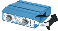
Wedge 및 We